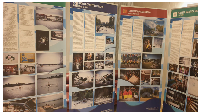
A glimpse of the spectacular exhibition celebrating the 130 year anniversary of the foundation of the International Rowing Federation