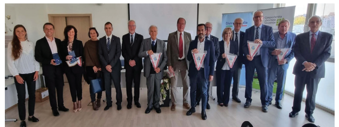
Participants at the opening ceremony and witnesses, both Italian and Slovenian, of the birth of a new club