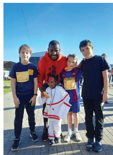
On this picture some children together with Olympian marathon medallist Mr Bashir Abdi.