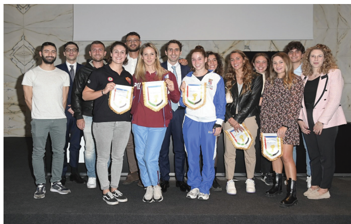
Le cinque campionesse del nuoto azzurro con i soci Junior