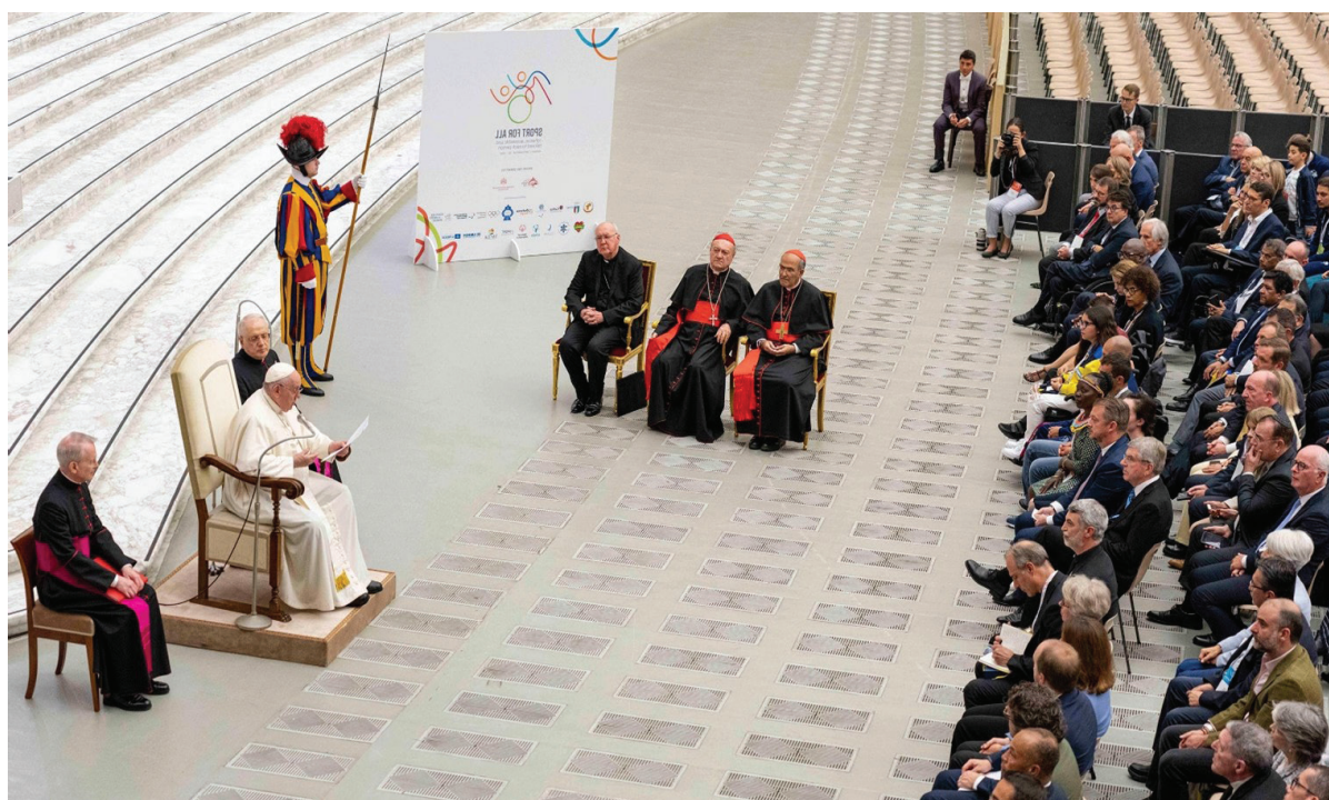
Pope Francesco addresses his message of sporting fraternity to top Olympic executive: in the first row IOC Preseident, Thomas Bach

The congress was attended by representatives from different Christian denominations and other religions, along with representatives of non-profit organizations and educational institutions working for inclusion in society through sport.