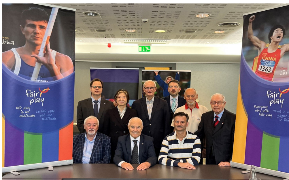
The Board of the International Fair Play Committee