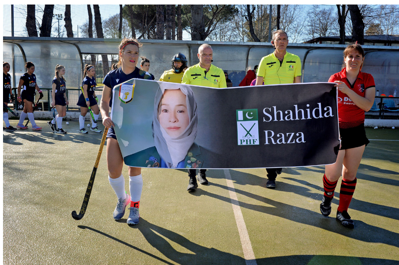
Banner displayed on the field by athletes