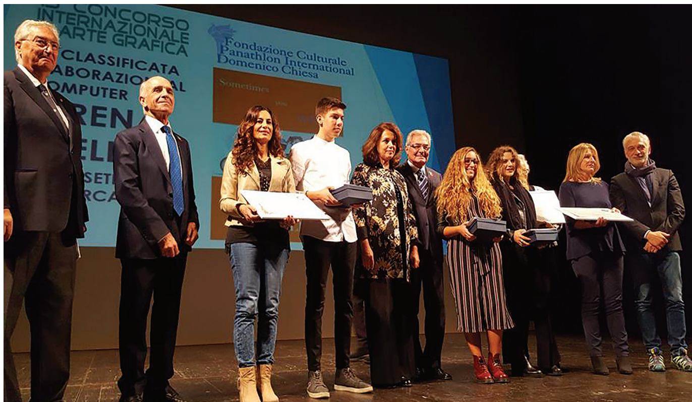
The winners of the XV International Graphic Competition