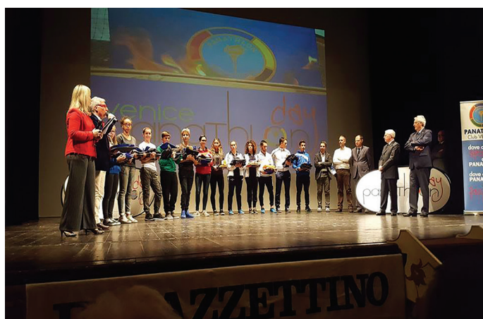
All candidates for the Student - Athlete Competition

There is always a great anticipation for the winners of the four categories - m/f middle school and high school m/f - of the competition for the best school and sports works achieved. In addition, many boys and girls participated in the Panathliadi and all the Physical Education teachers involved, accompanied by some school leaders.