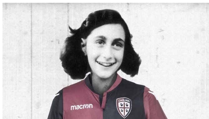
The staggering photomontage, with the face of Anna Frank, spread by the worst Lazio fans

Without the attitude of awe that sport has faced them so far, to the point that they seem to dictate the rules. That is, the criminals and the violent people who took the football hostage, taking it away from the imagination of the true fans.