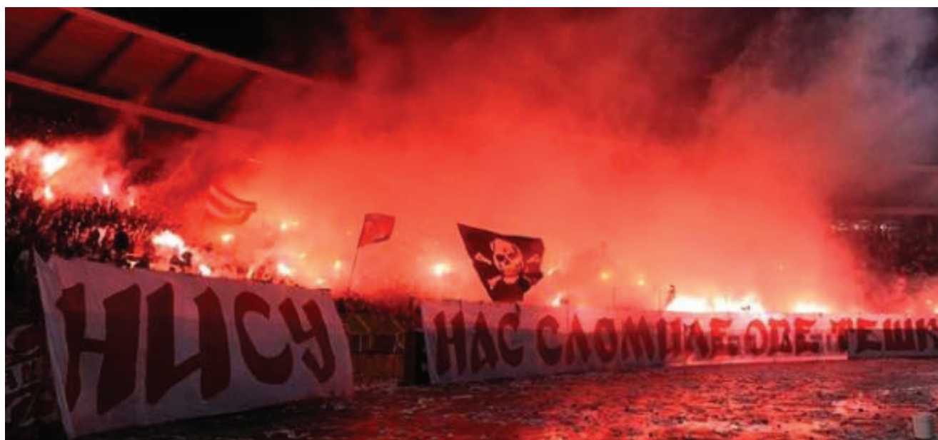
The Red Star Curve at 'Marakana' in Belgrade: the world's fiercest fans

A ranking made by the British radio broadcaster “Talksport” puts in line the world’s worst supporters, with only a partially credible view, given that among the top ten groups do not include the English hooligans that everyone knows well in the world, because of their violence and opposition to every order set up inside and outside the stadiums. For curiosity, let us see this ranking. Everyone puts the English fans in the place you want, based on your experiences.